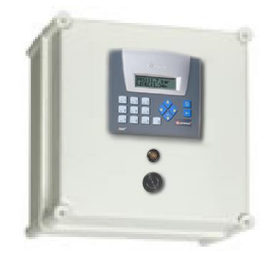
O2 depletion alarm